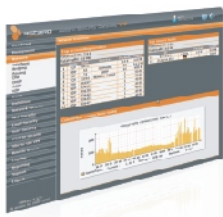
Astaro Security Gateway 110